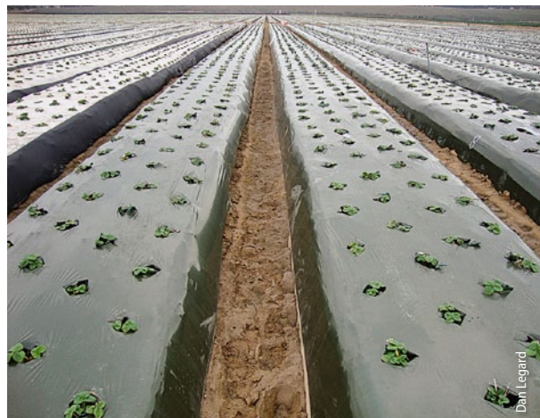
Strawberries planted in substrate at Mar Vista Berry, Santa Maria. One of the main concerns in soilless strawberry production is the maintenance of a favorable pH, EC and nutrient supply to the growing plants.