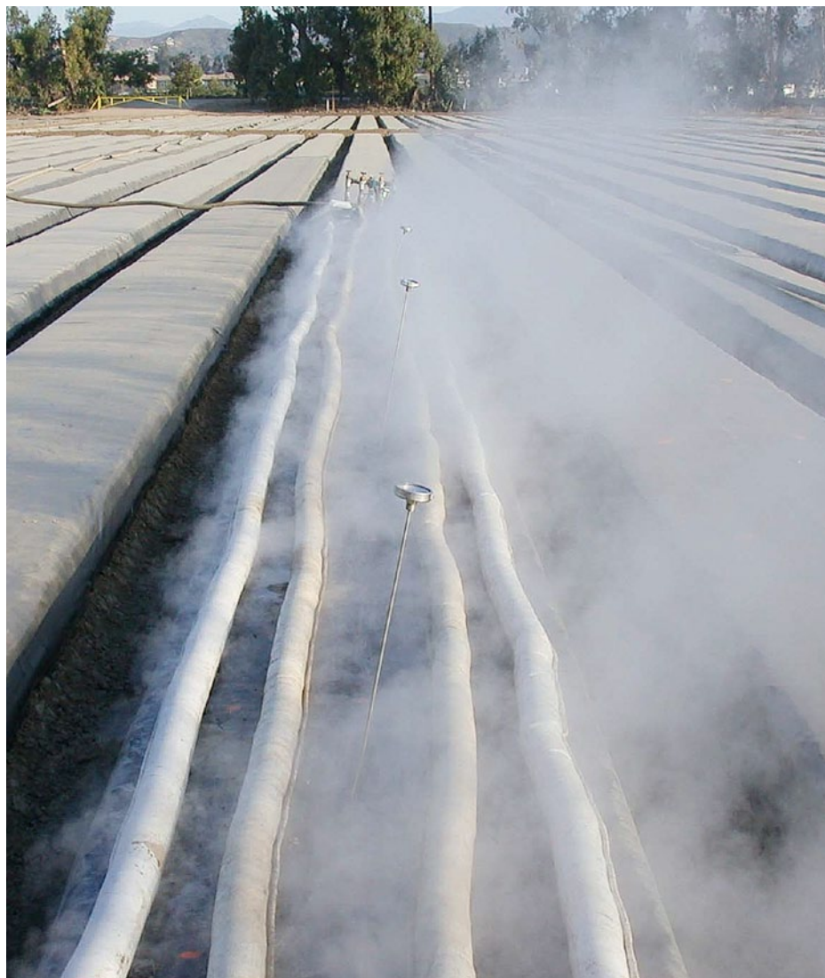
In a multi-year study of strawberry production systems, the use of nonfumigant alternatives such as heat treatment with steam resulted in fruit yields comparable to those produced using conventional fumigants. Above, steam application to strawberry beds prior to planting near Camarillo, CA.

California's coastal districts, where 86% of the nation's strawberries are produced on 38,600 acres, are the most productive strawberry-growing areas in the United States (CSC 2011; NASS 2011). To achieve this level of productivity, California strawberry producers need effective soil disinfestation, productive varieties and cultural practices such as polyethylene mulch and drip irrigation (Strand 2008). Strawberries are very sensitive to soil pathogens, and growers with these highly productive systems have become dependent on preplant fumigation. Traditionally, they used methyl bromide plus chloropicrin (MB + Pic) as the basis for soil pest control. Fumigation with