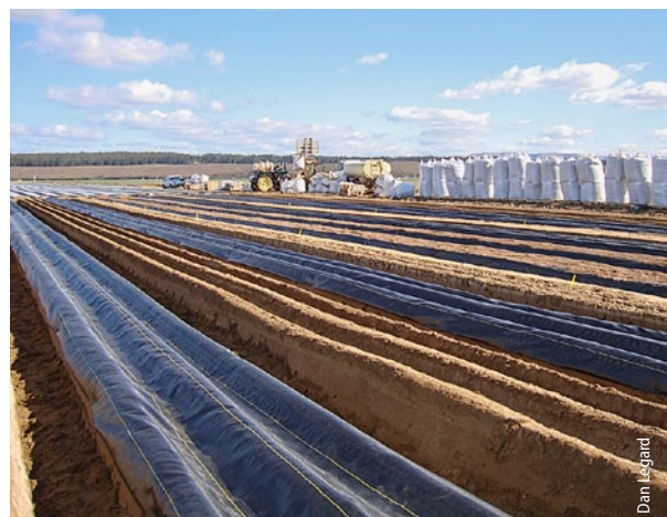
In a raised bed trough system, troughs are cut into each bed and lined with fabric that permits moisture penetration but not root penetration. The troughs are then filled with clean substrate materials. Here at Mar Vista Berry, Santa Maria, yields surpassed those from standard fumigation plots.

The primary justification for using this system is that strawberry crops can