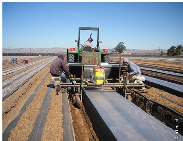
Once the troughs are filled with substrate (left), the beds are covered with film. The beds can be left in place for several crop cycles. No fumigant is used.