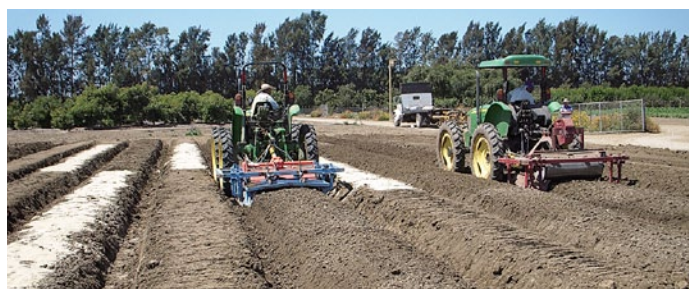
Rice bran can be incorporated before or after strawberry beds are formed. Shown are broadcasting, left, or bed top, right, application methods.