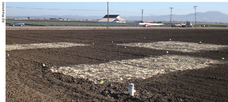
In preparation for anaerobic soil disinfestation, rice bran is applied to the planting field. This nonchemical alternative to methyl bromide was developed in Japan and the Netherlands.

Trial results. Overall, the steam treatment and the steam treatment with mustard seed meal were as effective as Pic-Clor 60 in providing weed control (table 3). Anaerobic soil disinfestation plus rice bran suppressed weed densities, but it was less effective than Pic-Clor 60. No