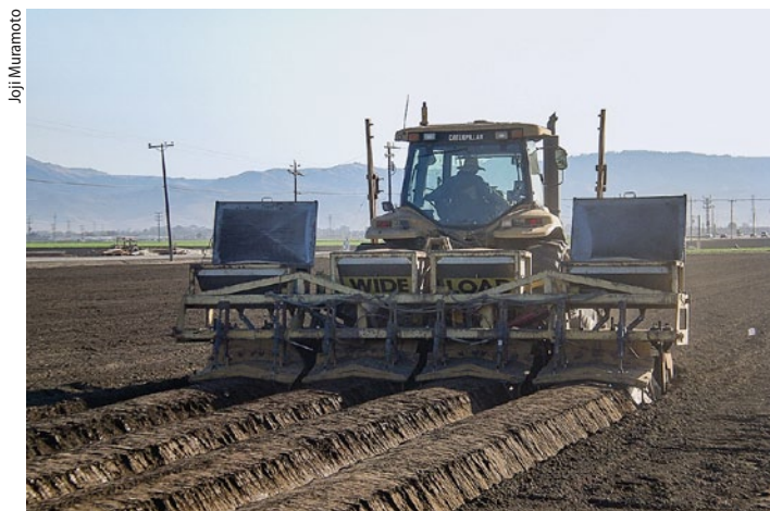
Listing of beds after incorporation of rice bran at Salinas, CA. Drip irrigation tape and then tarp will be installed so that the beds are ready to irrigate to create anaerobic conditions.