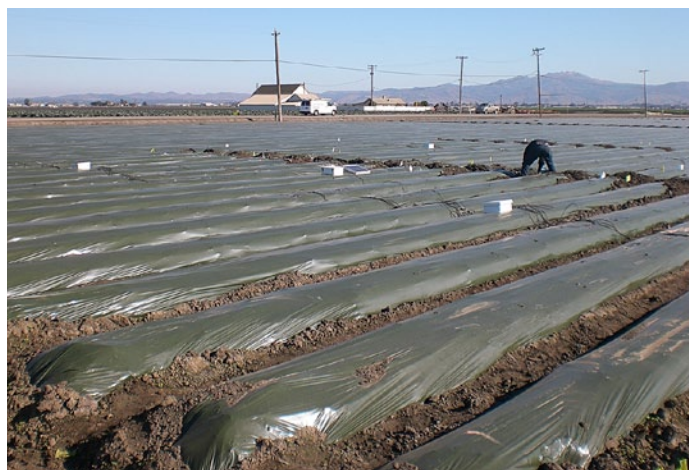
Water is applied to the covered strawberry beds to create anaerobic conditions prior to planting. Anaerobic soil disinfestation was very effective in suppressing Verticillium dahliae in soils, and it resulted in 85% to 100% of the marketable fruit yield observed with fumigated controls in coastal California strawberries.