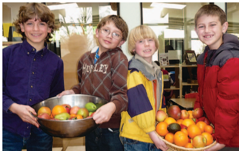
As part of the Cooperative Extension Centennial Campaign, the Yolo County Cottonwood 4-H Club received a grant for a nutrition project to inspire healthier eating habits. It included classroom nutrition lessons, weekly deliveries of fresh fruit for 10 weeks, taste tests of seasonal fruits and making bicycle-powered fruit smoothies.

A third of school-aged children in California are overweight or obese, and at current rates nearly half of the state's adults could be obese by 2030.