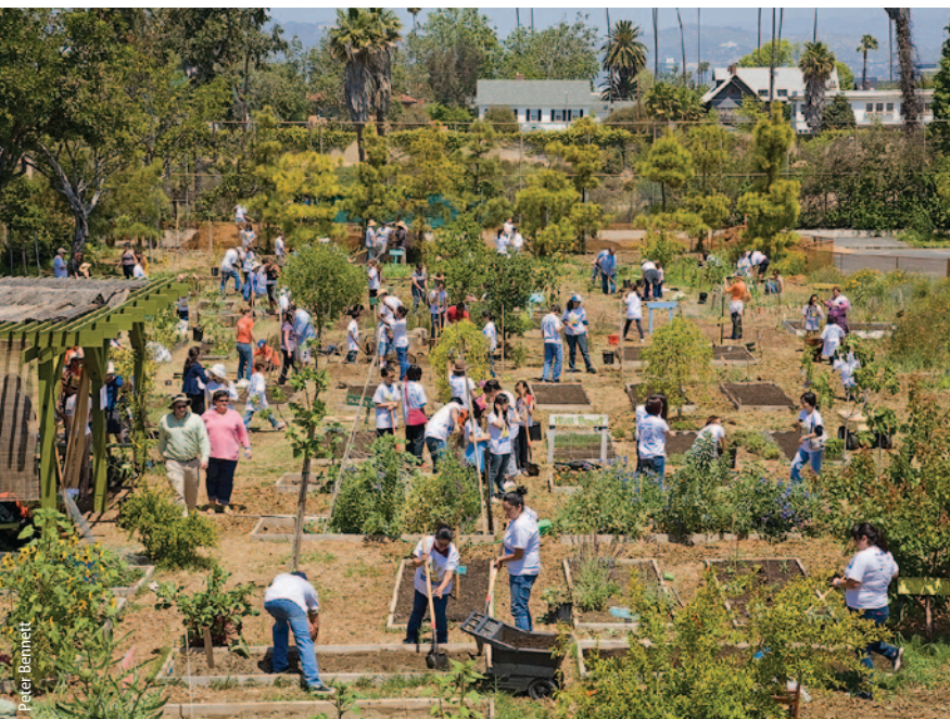
Students, parents and teachers work on the garden at the 24th Street School garden in Los Angeles on Big Sunday, the nation's largest annual citywide community service event. This prototype garden classroom spans more than one acre and includes an orchard with 55 fruit trees.

Designed to both improve child health and support local agriculture, the program incorporates serving regional fruits and vegetables, a salad bar, a hands-on garden, and classroom nutrition and physical fitness lessons. Just as importantly, the program is aligned