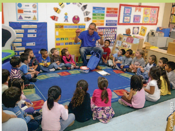
Shaping Healthy Choices incorporates serving regional fruits and vegetables, a hands-on garden, and classroom nutrition lessons. It is aligned with California's core content standards in science, math, language arts and social studies.