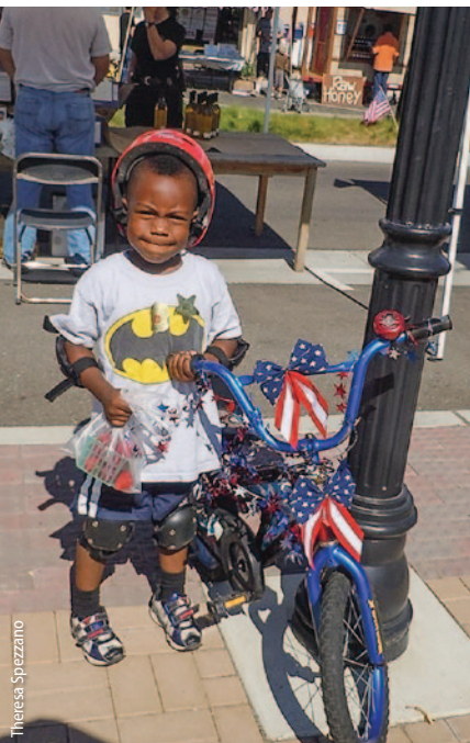
Fresh fruit can substitute for sweetened beverages and fast food, two of the strongest factors driving obesity. Above, bicyclist participates in Get Fit Riverbank, a summer program in Stanislaus County.

Two of the strongest factors driving obesity are sweetened beverages and fast food, and decreasing their consumption is just as important as increasing the consumption of healthy foods. "You have to do both," Crawford says. "In the past, we worked to help people increase their intake of healthy foods, and now we realize that they also need to decrease their intake of less healthy foods."