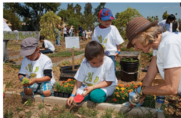
The 24th Street School instructional garden in the West Adams neighborhood of Los Angeles includes California native gardens, 16 vegetable production beds, an orchard of fruit trees, and shaded teaching areas.

While these Healthy Families and Communities efforts underscore the complexity of the challenges facing youth, they also highlight the promise of taking an integrated approach to solving problems from obesity to science illiteracy to youth disengagement. Says Healthy Families and Communities initiative leader Campbell, "If we shift public thinking, policy and resource allocation, we can shift these trends in a positive direction." — Robin Meadows