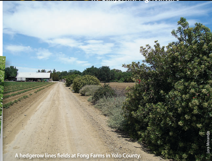
A hedgerow lines fields at Fong Farms in Yolo County.