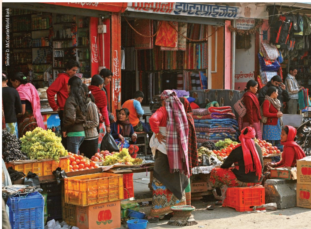
Some researchers and policymakers blame biofuel production mandates for the food crisis of 2008, which caused record-high prices and political unrest in some developing countries. Above, a food market in Kaski, Nepal.

The degree to which biofuels contributed to high food prices is likely overstated in the popular press, but even researchers don't agree on how much blame rests with biofuels. At the same time that food prices climbed, energy prices, particularly for oil, rose considerably, increasing the costs of transportation and further constraining