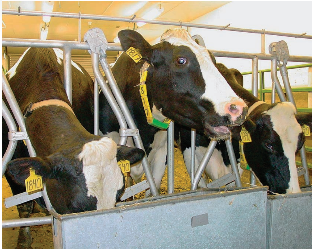
Holstein dairy cows were housed in an environmental chamber for 24 hours to accurately measure all their emissions of greenhouse gases, including methane and nitrous oxide; the cows were fed a total mixed-ration diet.

The three major anthropogenic greenhouse gases are carbon dioxide, methane and nitrous oxide, and agriculture contributes significant amounts of each. The IPCC estimated that globally, agriculture contributed 10% to 12% of anthropogenic carbon dioxide (CO 2 ), 40% of methane