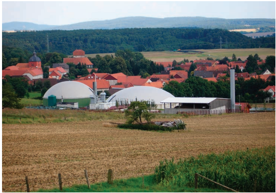
Covered lagoons and methane digesters are an option for reducing greenhouse-gas emissions from dairy waste. In Germany, the village of Juehnde built a digester for livestock waste and other biomass. The methane is combusted to produce electric power and heat for homes in the village, which is the first in the world to go “off the grid” through the use of its own waste.