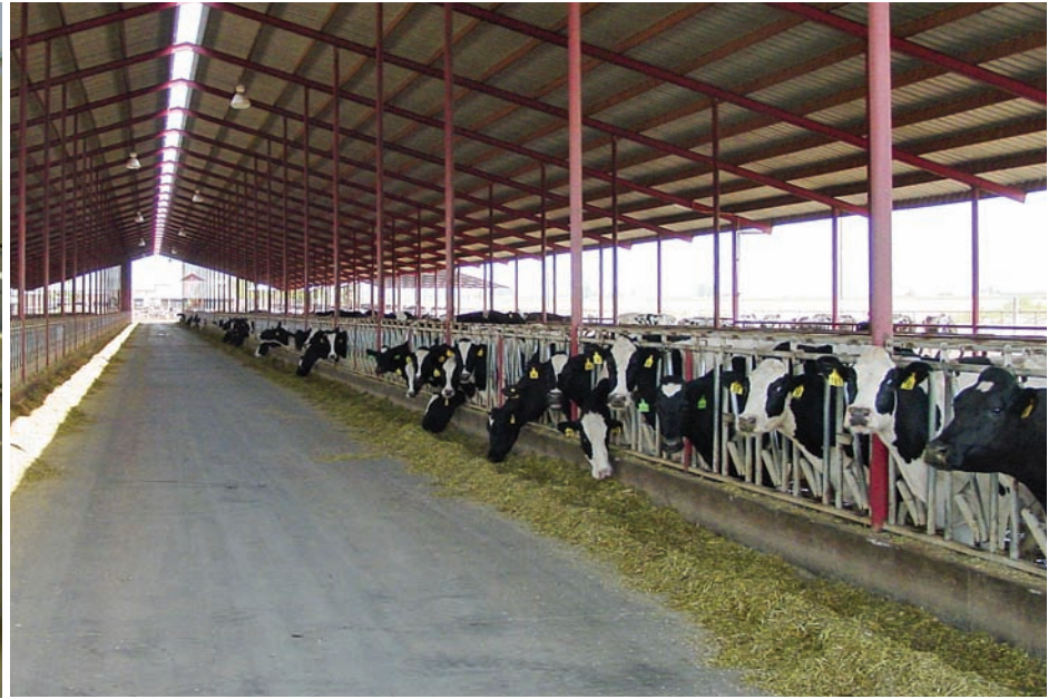
Strategies to reduce methane emissions from dairies include modifying cattle diets to enhance digestibility and improving milk production so that fewer cows are needed.

Volatile organic compounds. In a UC study, Shaw et al. (2007) showed that major volatile organic compounds from cows include methanol. This study also showed that of the volatile organic compounds from cows, the reactive (ozone forming) fraction was 6 to 10 times lower than the value for cows and fresh waste that California regulatory agencies have historically used to develop volatile organic compound inventories for ozone attainment in the San Joaquin Valley. Ozone contributes to global warming and thus all such ozone precursors should be considered in climate-change discussions.