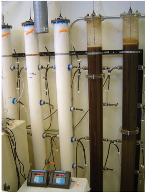
Laboratory-scale reactors were used to test the effectiveness of various manure treatments.