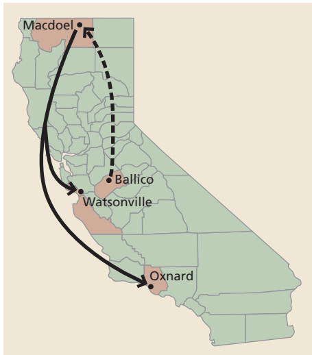
Fig. 1. Nursery production evaluations were conducted at a low-elevation site at Ballico. Harvested runner plants were then transported to Macdoel for use in the high-elevation experiment. Fruit evaluations were conducted on the coast at Watsonville and Oxnard.

ducted in strawberry nursery and fruit production systems to evaluate the effects of alternative fumigants on disease, nematode and weed control. We monitored the movement of plants through the system, allowing inferences to be made about the cumulative effects of fumigation. In addition, we gathered and evaluated information on the economics of production for each treatment. To our knowledge iodomethane has never before been evaluated in California strawberry nurseries. More detailed methods and results are published elsewhere (Kabir et al. 2005).