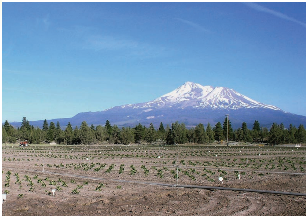
California strawberry runner plants are propagated in high-elevation nurseries such as this one near Macdoel, north of Mt. Shasta. The harvested runner plants are transported to fruiting fields in California or exported to other states or countries.

Methyl bromide (MB) is a fumigant that is applied to the soil before planting to provide season-long control of soilborne pathogens, insects, nematodes and weeds. Several vegetable, fruit and perennial crops rely on methyl bromide for pest control (USDA ERS 2000). In the United States, tomatoes, strawberries and peppers account for most of the methyl bromide used in soil fumigation (30%, 19% and 14%, respectively) (Carpenter et al. 2000). Other crops that use methyl bromide include almonds,