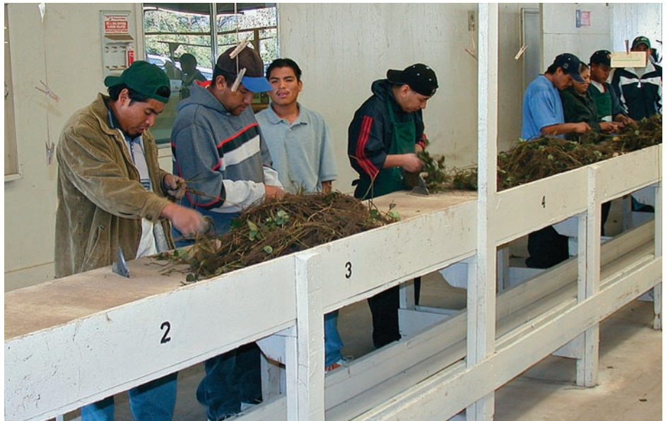
At Lassen Canyon's trim shed in Redding, workers sort strawberry plants harvested the previous day from high-elevation nursery fields. The workers separate healthy, marketable plants, trim them and then pack them for shipment to fruiting fields on the California coast.

At Macdoel, the treatments evaluated were: (1) equal amounts of iodomethane and chloropicrin at 350 pounds per acre; (2) methyl bromide plus chloropicrin at 400 pounds per acre (57% MB + 43% CP); (3) chloropi-