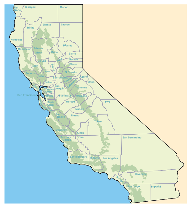
Distribution of oak woodlands and forests in California (shaded area).