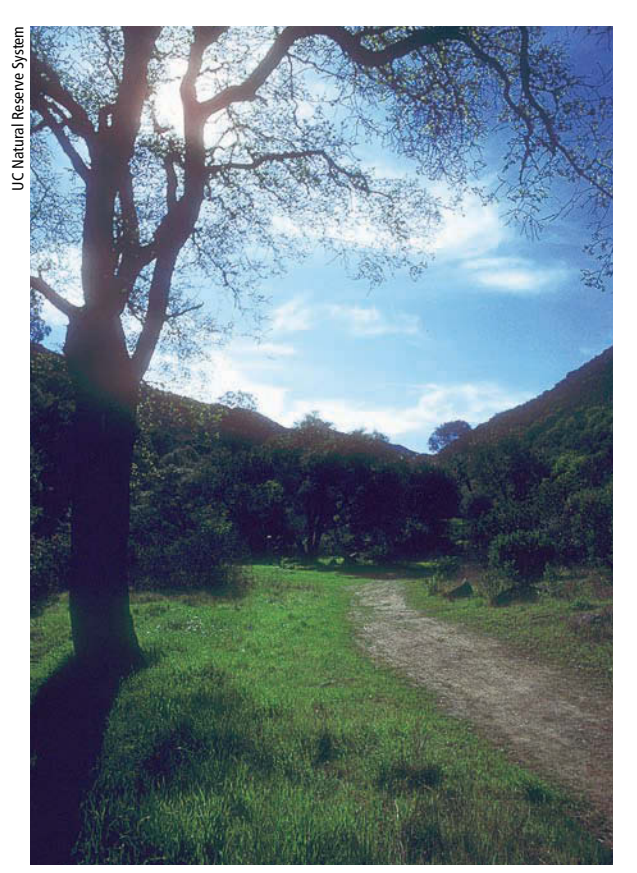
California's 10 million acres of oak woodlands are threatened primarily by land conversions to intensive agriculture and housing, and poor regeneration. Researchers can study oak habitat at the UC Natural Reserve System's Stebbins Cold Canyon Reserve in Solano and Napa counties.