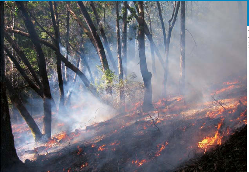
A controlled fire in Humboldt County helps remove contaminated leaf litter.