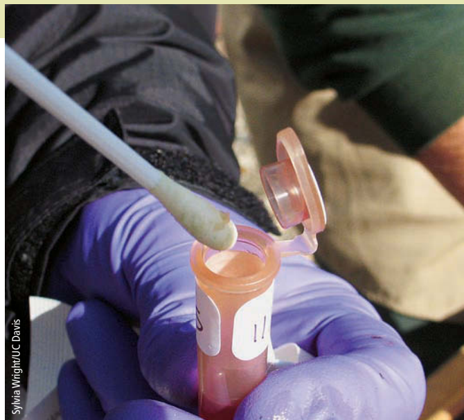
UC researchers conduct tests daily for avian influenza, which has not yet been documented in North American birds.

UC scientists at campuses, medical centers and Cooperative Extension offices statewide have been working to address the causes, risk factors and pre-