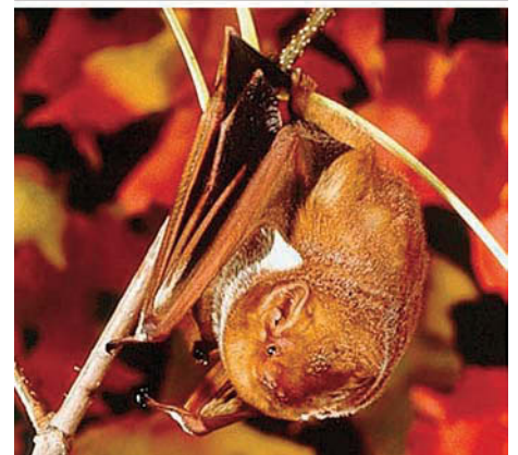
Bats found in California include: top to bottom, hoary bat, Mexican free-tailed bat and red bat.