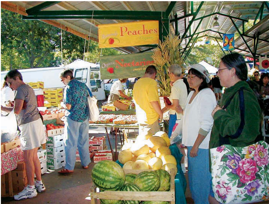
To encourage produce consumption among low-income consumers, the USDA could expand its Farmers' Market Nutrition Program, which provides $20 million in coupons annually to low-income and elderly persons for farmers' market purchases. Left , shoppers at the popular Davis Farmers Market.

probably have to be designed to minimize impacts to existing food assistance programs, depending on commodity distribution. For example, some commodities that currently qualify for direct payments — which eventually make their way to entities such as food banks and schools through FNS food distribution programs — could be negatively affected by a reduction in commodity availability and price.