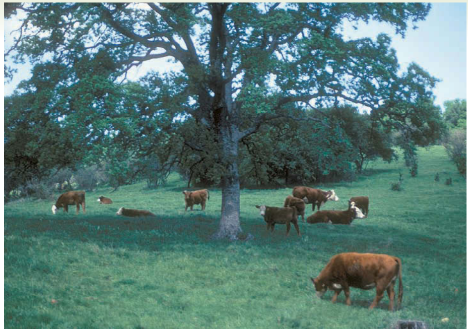
Most oak woodlands in California are privately owned and used primarily for grazing; however, livestock grazing is an important factor in the state's documented low rates of oak regeneration.

Describing the foothill oak woodlands in the Carmel Valley, White (1966) stated that "a prevailing characteristic . . . is the lack of reproduction . . . with very few seedlings." A survey of 15 blue oak