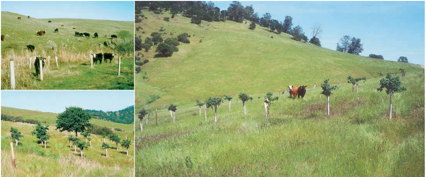
Tree shelters have proved effective in preventing cattle from trampling and grazing on oak seedlings. By the time oaks reach about 6.5 feet, they are generally able to withstand cattle damage in little- to moderately grazed pastures.

low-cost procedures for restoring oaks. Several of these studies have been conducted in areas grazed by cattle, with the objective of identifying how oaks can be established in grazed pastures without removing these lands from livestock production. The question of how cattle and oaks can be raised together is important because more than 80% of California oak woodlands are privately owned (Ewing et al. 1988), with much of this land in livestock production.