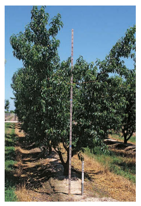
The objectives of this research were to find rootstock-scion combinations with reduced trunk size, reduced pruning weights and acceptable fruit size and crop yields. Above , the clingstone Loadel scion grafted onto rootstock K146-43 was one of the more successful combinations in a trial orchard, producing a tree circumference 61% of current industry standard, Nemaguard.

except in years 1, 4 and 7 when they were only dormant-pruned (DeJong et al. 1999). We adjusted the severity of pruning according to the growth characteristics of each rootstock/scion combination to optimize crop production while developing or maintaining the desired tree shape. The first significant fruit set occurred in the third leaf. We also adjusted crop load for tree size by hand-thinning to maintain a minimum spacing between fruit. Because patterns of fruit maturity varied somewhat with