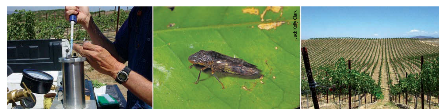
Left , xylem is placed in a pressure bomb and will later be tested in the UC Riverside laboratory for neonicotinoid insecticides that kill the glassy-

Toxicity. Neonicotinoids share with the pyrethroids a relatively low risk of dermal toxicity to mammals (table 3), and their oral LD_{50} s make them suitable for use on fruit and vegetable crops. As their registered crop uses expand on California's "minor use" or "specialty" crops (generally those grown on 300,000 acres or less), they will likely replace many OPs. Where they have already been registered, such as on lettuce and cole crops, their use is well established (table 2).