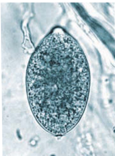
Phytophthora ramorum , the pathogen that causes sudden oak death.