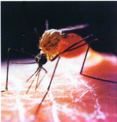
Jack Kelly Clark

Sequencing of the mosquito genome could help to prevent malaria, which kills 2.7 million people annually. However, the scientific community was urged to use caution when pursuing genetic modification of insects.