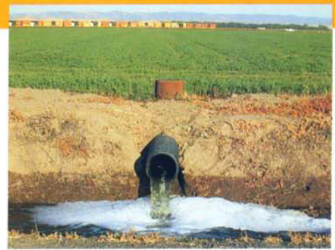
Irrigation tail water, above, may contain pollutants such as pesticide residues, sediment, nutrients and salt. Research by UC scientists describes how insecticide choice in alfalfa may affect aquatic life.