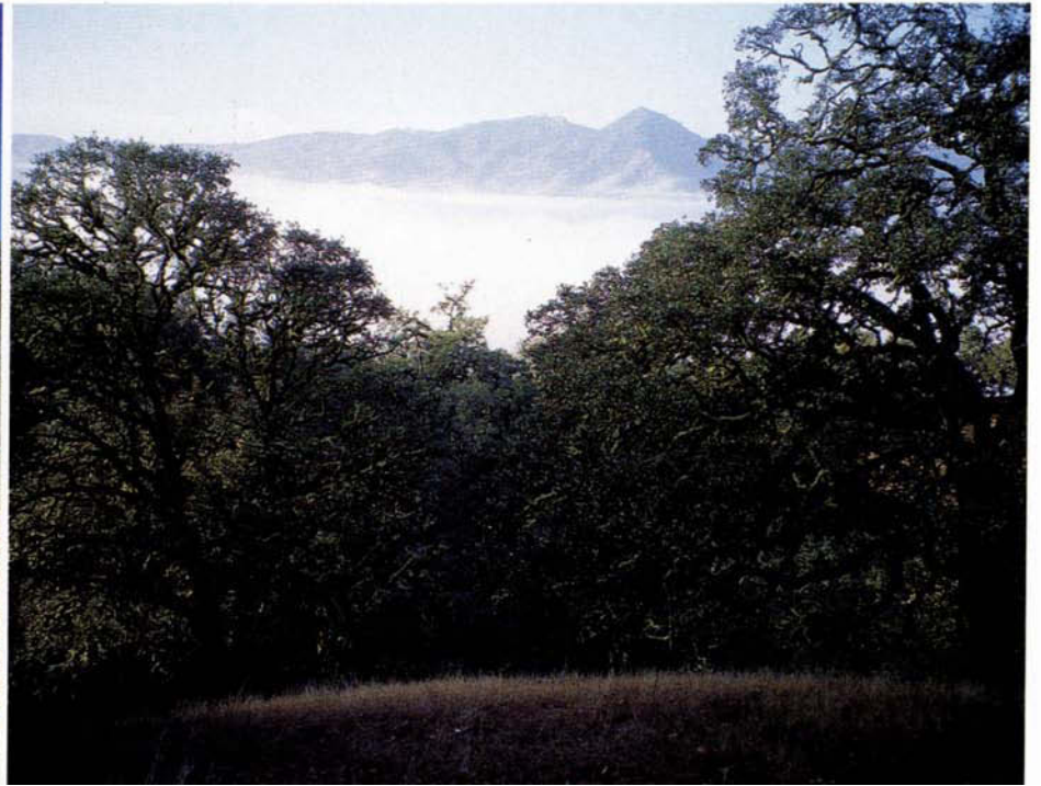
In the late 1990s, scientists launched a new series of studies on seven experimental watersheds at Hopland. Chaparral, left, is the dominant vegetation type on higher elevation (1,600 to 2,000 feet) watersheds, while oak woodlands, right, are typical at the lower elevations (500 to 1,000 feet).

next water year, resulting in greater water yields.