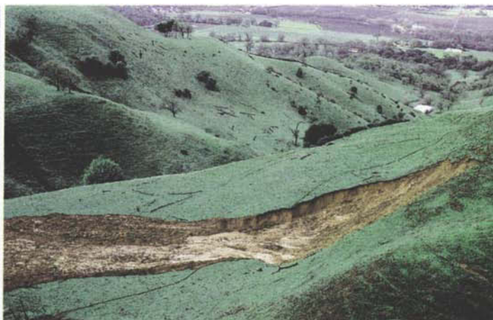
Watershed II was cleared in 1965, left; 20 years later, a large soil slip occurred following February rains, right.

municipal drinking-water quality, and costly wildfires due, in part, to unmanaged vegetation.