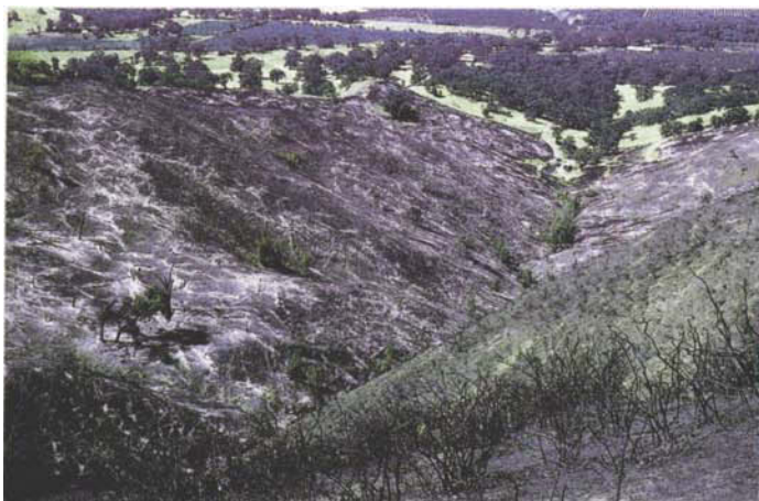
Between the late 1950s and early 1980s, watershed research at HREC focused on the impacts oak woodland-to-grassland conversion on water quantity, slope stability and erosion.