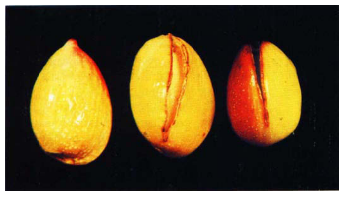
For most pistachio nuts, the hull remains intact until after harvest, left, whereas a small percentage of nuts rupture their hulls either by cracking, middle, or splitting along the shell suture, which is characteristic of early-split nuts, right.

in water applied (about 16 inches less than the control) but only a relatively small difference in the incidence of early-split nuts (table 2).