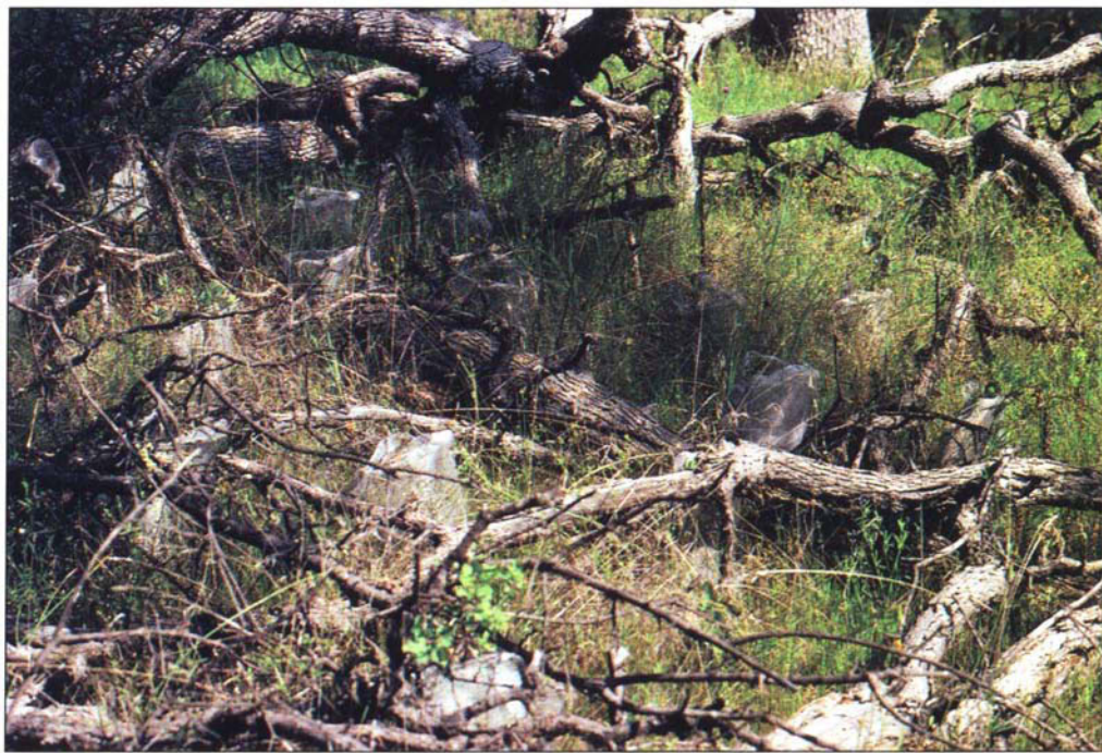
Above, A seedling was growing in each of the cages as of April 1996, 4 months before all three planting sites burned in the Highway 58 wildfire. Below, Vegetation in two of three brush piles burned to a white ash, background , by the wildfire, while combustion in no-brush plantings, foreground , was less complete.

Survival was defined as at least one live tree from the three acorns planted in each hole. No significant differences were detected between the seedlings