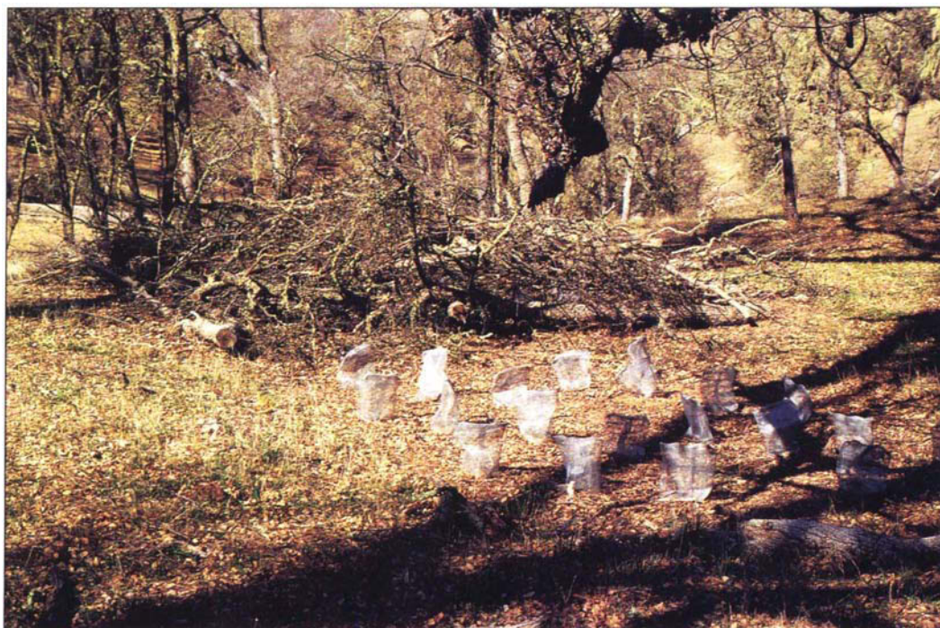
Brush piles settled down about 2 years after planting (shown February 1990), but still appeared to be excluding cattle and deer. Cages remained intact and in place, whether or not brush piles surrounded them.

southeast of Pozo, San Luis Obispo County. Annual rainfall averages about 20 inches. Herbivorous animals in the area include cattle, deer, gophers, ground squirrels, mice and cottontail rabbits. Cattle graze here about 6 months of the year and use prominent trails near the plots. This is a popular but remote deer-hunting area with a campground for hunters about one-half mile away. Gophers are numerous, as evidenced by their mounds.