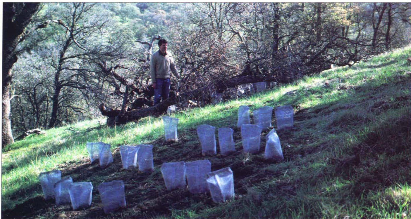
In a 12-year study of protection methods for oak seedlings, half of the acorn plantings were protected with aluminum cages. Plantings were also covered with brush, background , and left uncovered, foreground .