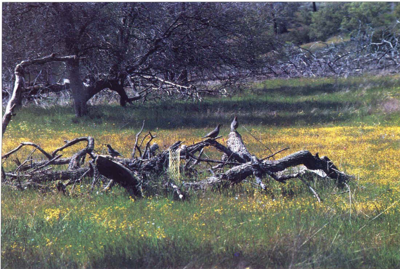
Quail are attracted to brush piles, like this small one at a different research site in San Luis Obispo County.

in a few days. Fire temperatures were higher in the brush plots, as shown by white ash from the oak branches, than in the no-brush plots, where there was lighter fuel, primarily of grasses.