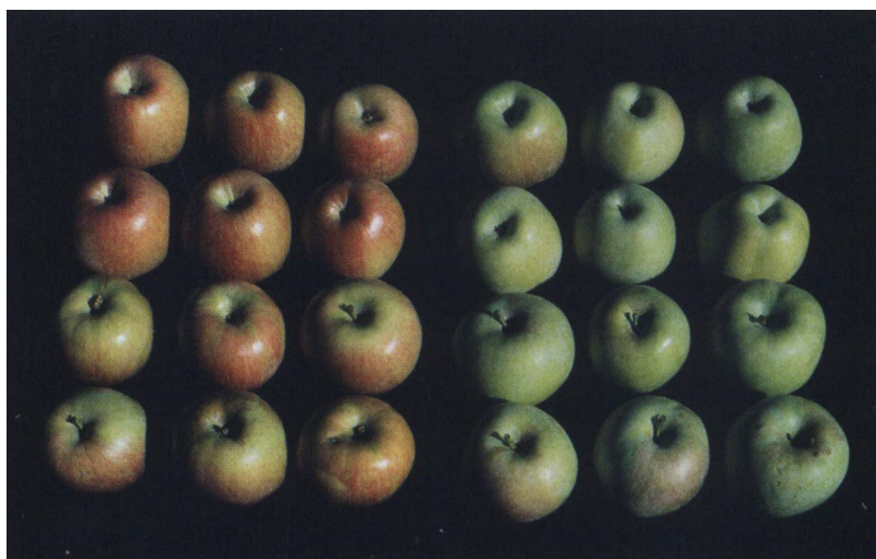
▲ Apples grown with reflective material (left) developed more red skin color than apples grown without (right).