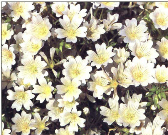
Seeds from meadowfoam ( Limnanthes alba ) provide oils for high-tech lubricants.

But what can be done about species that are already endangered? In some cases there is so little habitat remaining that we can only conserve seeds in cold storage or in a botanical garden. However, under such artificial conditions, genetic variability erodes due to artificial selection, genetic drift and inbreeding. In addition, there is no way of conserving insect pollinators and other organisms that may be crucial to the existence of the endangered plant. This approach is both costly and uncertain, and scientists regard it as the last alternative for plants on the very