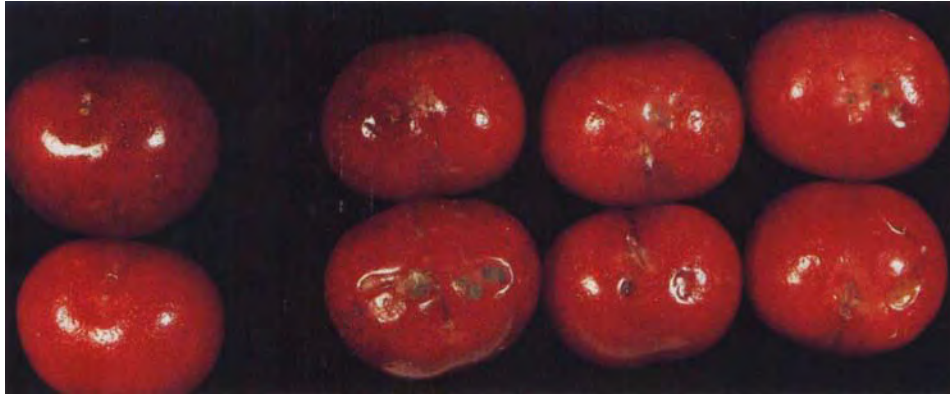
The six 'Brooks' cherries on the right exhibit symptoms of pitting. Cherries handled at colder temperatures suffer more pitting and bruising damage.