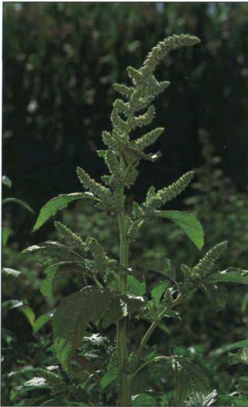
Higher populations of pigweed, a preferred host of the armyworm, seemed to aggravate pest problems for the organic tomatoes.

tor setup used varied according to the crop. In processing tomatoes, cultivation was done using a pair of disks, each set within 2 inches of the tomato seedline followed by L-shaped weed knives to clean the sides of the beds. Safflower and beans were cultivated using a rolling cultivator (Lilliston),