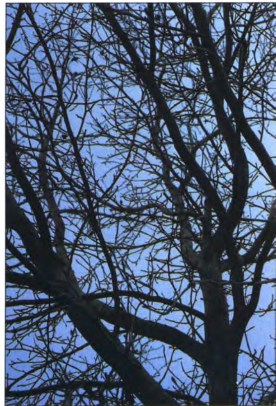
Nearly all of the fruit has been eliminated from this ethephon-treated liquidambar (December 1991).

plot averages by these baseline figures gave us the percentage of fruit remaining in test trees; subtracting the percentage of fruit remaining in test trees from 100 gave us the percentage of fruit eliminated.