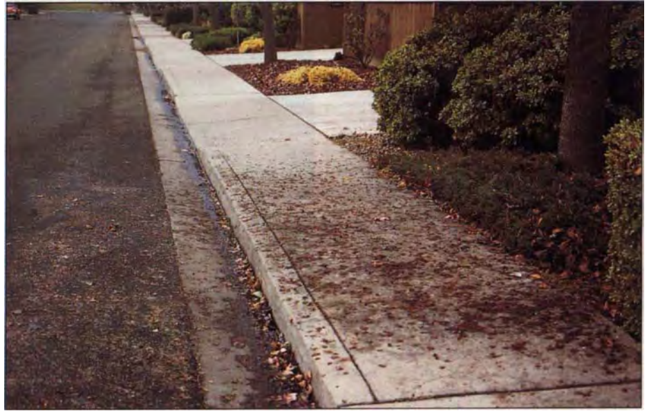
An 'Aristocrat' flowering pear has littered the sidewalk and street with its crushed fruit, rendering the area slippery and unsightly (January 1991).

We conducted trials in 1989, 1991 and 1992 on heavy-fruit-producing mature trees (over 10 years old) being