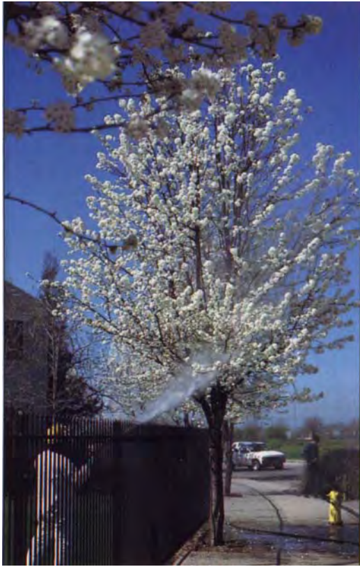
Ethephon spray being applied to 'Aristocrat' flowering pear at full bloom, the optimum application time (March 1989).

with broad-leaved mistletoe, as the pear fruits attract birds carrying mistletoe seed from other locations. Controlling the mistletoe is another parks department expense.