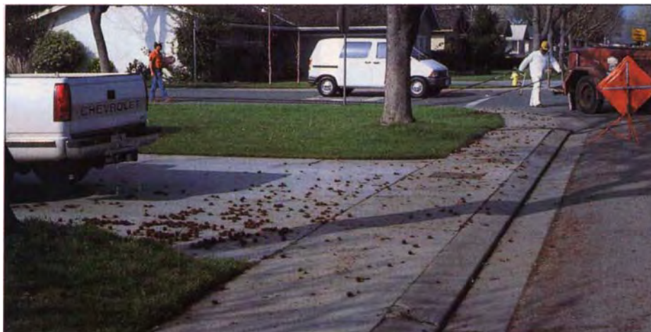
Liquidambar fruit hang on the trees through winter, then drop in early spring in great numbers.