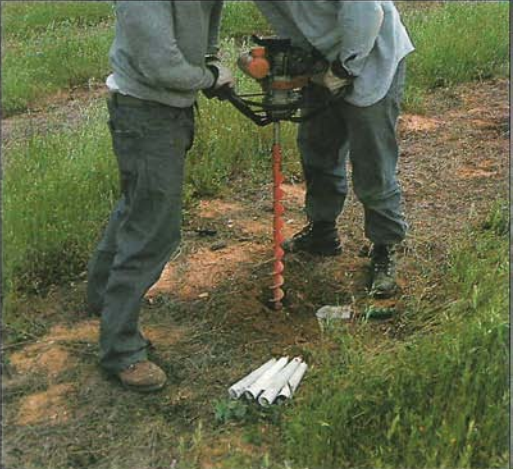
Power auger used for planting.