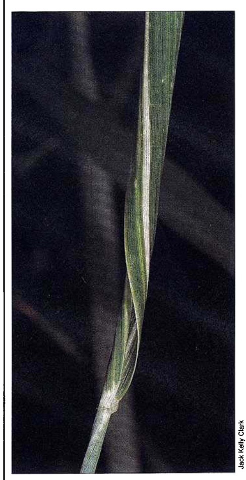
Russian wheat aphids feeding on a leaf (top) inject a toxin injected into the plant, causing leaves to streak and curl (above).