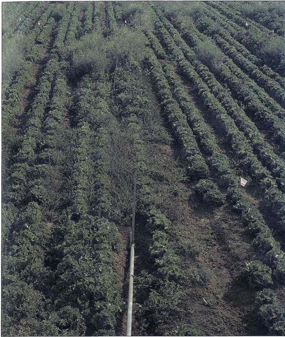
Lettuce and weeds compete, with various results, in these comparison plots at the West Side Agricultural Field Station.