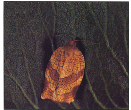
Although it hasn't been considered a pest of pistachios, the obliquebanded leafroller has been discovered causing feeding damage on pistachio foliage and nuts in Madera County.