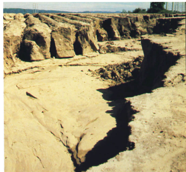
Soil erosion affects 8.8 million acres of California's land surface. Buildup of salt because of poor drainage (below) threatens another 1.6 million acres.

In the past, production capacity that was lost when land was urbanized or physically damaged could easily be replaced by bringing new lands under irrigation and by increasing per-acre yields. Because the water supply is limited, however, continued expansion of irrigation may be near an end. According to AFT's survey of agricultural experts in California, approximately 300,000 acres of dry land could reasonably be put under irrigation in the near future. Most of this land adjoins presently irrigated areas: around the rim of the Central Valley; adjacent to the Imperial/Coachella growing area; and in the coastal areas, where, as noted, a maximum of 10,000 acres might be add-