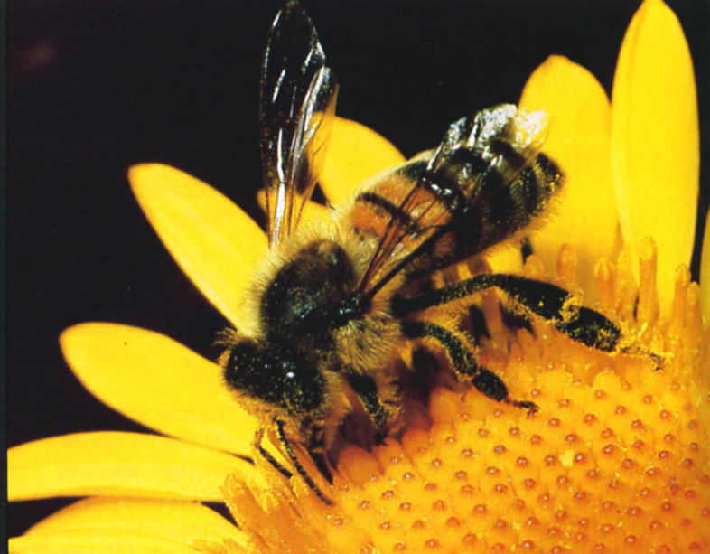
Although the African honey bee (above left) is slightly smaller than its European counterpart (right), the two belong to the same species, and only a highly skilled expert using sophisticated techniques can tell them apart. Africanized colonies are easily aroused, a trait that has given them a reputation as "killer bees."