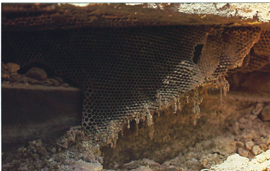
Africanized bees show little discrimination in where they build their nests: in the ground, in termite mounds, under buildings, in exposed areas, even in old cars. Norman Gary, UC bee researcher, checks the nest of the first Africanized bee colony discovered in the United States, near Lost Hills, California, in June 1985. The well-established nest contained approximately 20 combs.

minutes for Africanized bees compared with 3 minutes for European bees. Researchers concluded that Africanized bees are up to ten times more active in stinging than European bees.