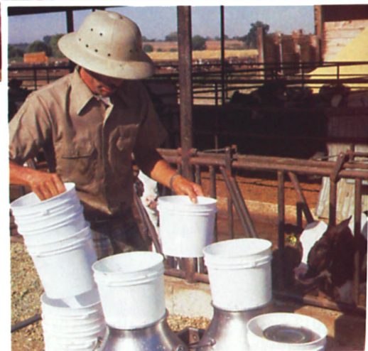
The "average" length of employment of dairy workers in California in 1983 was more than four years, much longer than 30 years ago.

The workers had a collective total of 147 job changes. Only one reason for 90 percent of the job changes was given by the respondents (left to get higher pay, got fired, etc.). Even when there were many reasons for leaving, one was predominant. Only one worker had more than two secondary reasons for leaving. Workers were asked only for the reasons why they left, not what they liked or disliked about previous jobs.