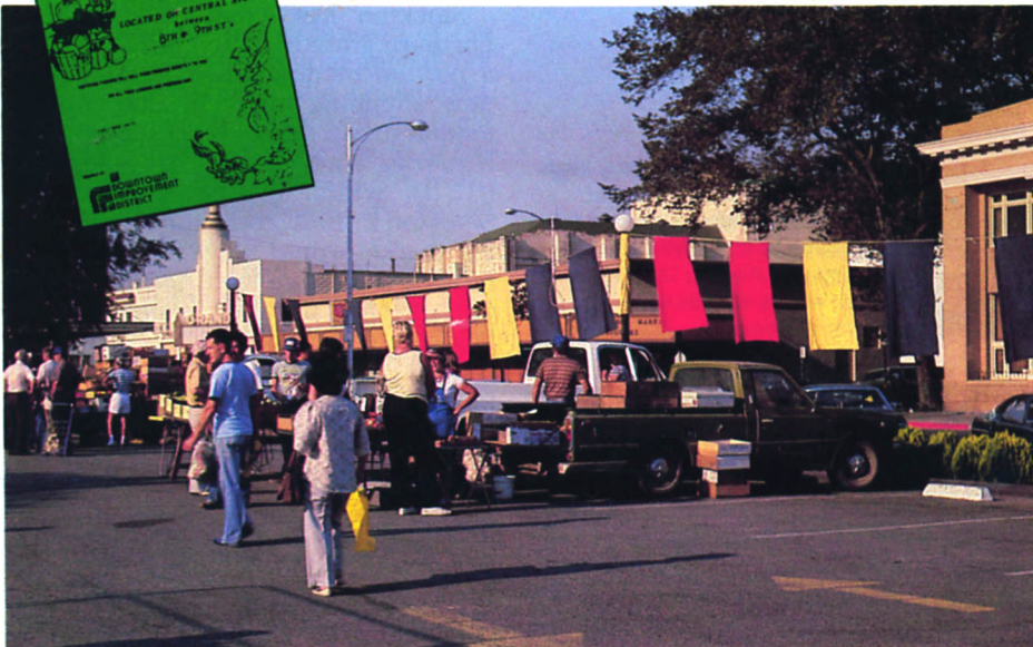
The Tracy, California, farmers' market fronts on one of that city's main business streets, drawing customers downtown.

town, which now seemed a more pleasant place, friendlier, and more populous. It seems likely that in the future farmers will be more likely to shop there on non-market days and to convey these good feelings to other prospective shoppers.