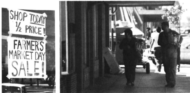
Farmers' market in Tracy highlights urban-rural contrast. Some stores have sales on market days to lure strolling shoppers. Above: During-and-after views of Stockton farmers' market.

large mall in nearby North Stockton drained business away from the central district. The Downtown Improvement District regarded the farmers' market as one positive force in bringing people back into the downtown area.