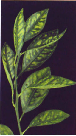
An early disorder of citrus called "little leaf" was corrected after U.C. scientists traced it to a deficiency of zinc.

others, few well-managed citrus orchards in California suffer yield restraints from faulty fertilization, whereas before World War II, most orchards produced below potential because of poor fertilizer practices.