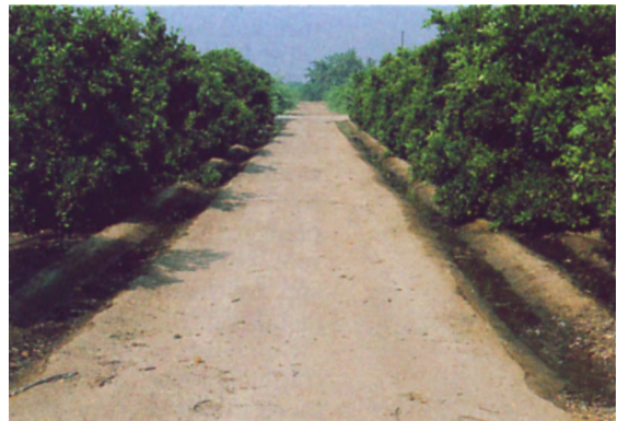
Typical nontillage California citrus orchard, where herbicides replaced mechanical cultivation by the mid 1960s.

that alternate bearing in Valencia can be reversed by the removal of all young fruit in July of the "on" year.