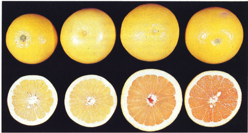
Effect of climate on quality of Redblush grapefruit. All were harvested during last week in January from genetically identical trees of the same age receiving similar cultural treatment. Two fruits on left are from two cool coastal valley locations; two on right from hot to very hot, arid interior valley climates. High temperatures produce large, early-maturing fruit and stimulate the pink pigmentation.

Fruit thinning: The number of fruit per tree and fruit size are usually inversely correlated. Because small fruit size is sometimes a problem with the Valencia orange and some mandarins, considerable work has been done on the effects of thinning. Results have not been consistent; hence, thinning has not become a common practice. Hand-thinning is expensive and as yet, there is no chemical thinner that will do a consistent job. It has been shown