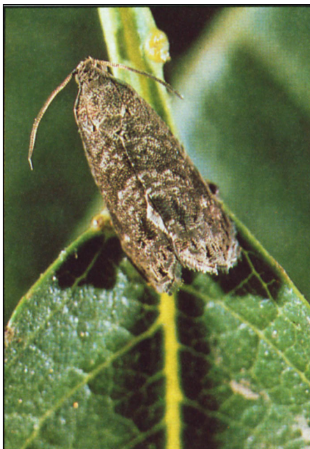
Oriental fruit moth adult.

After development of this model, the next step is to find ways to use it to advantage in OFM management programs, particularly in relation to the timing of chemical treatments. Dormant sprays do not affect overwintering