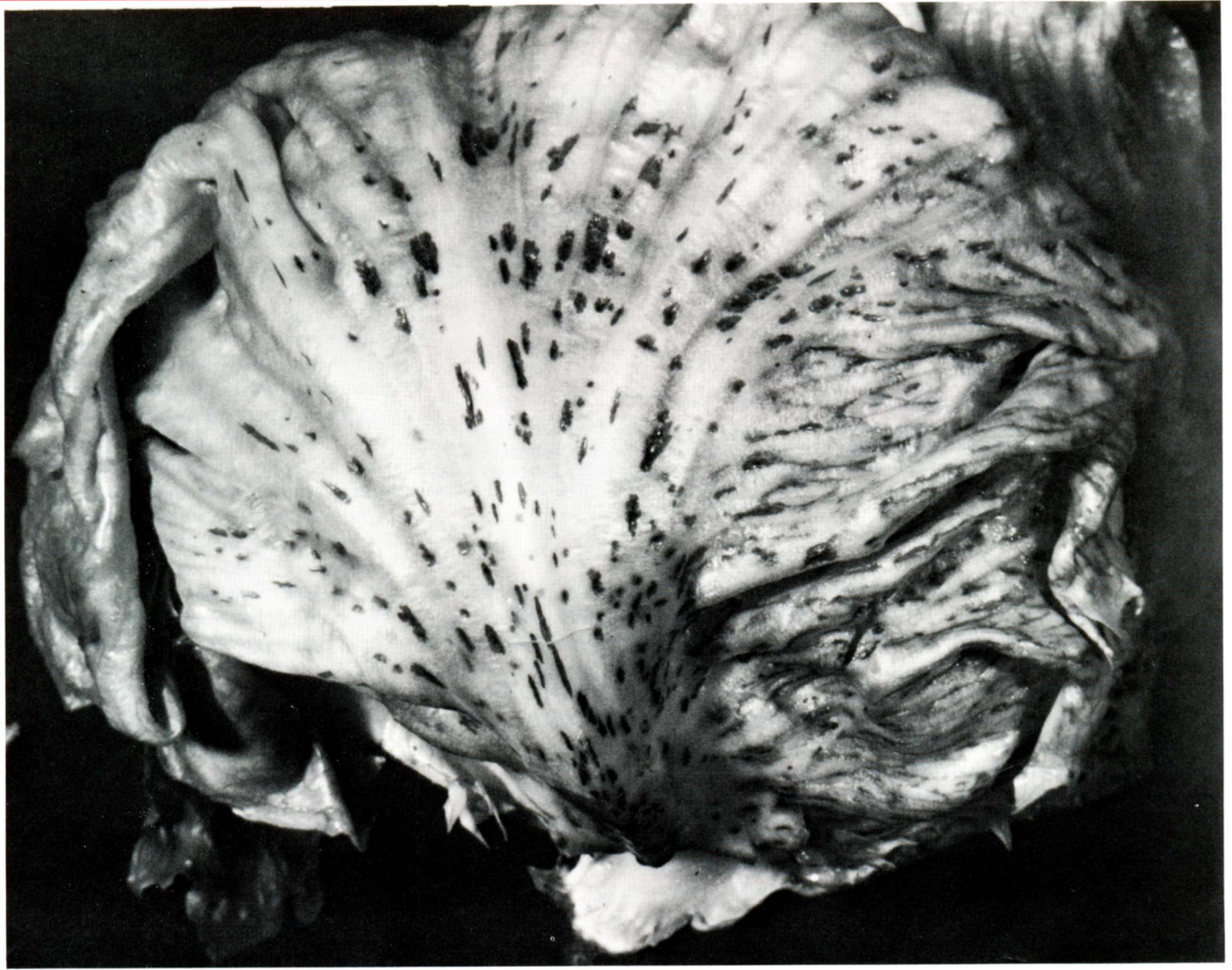
Fig. 1. Symptoms of russet spotting on lettuce.