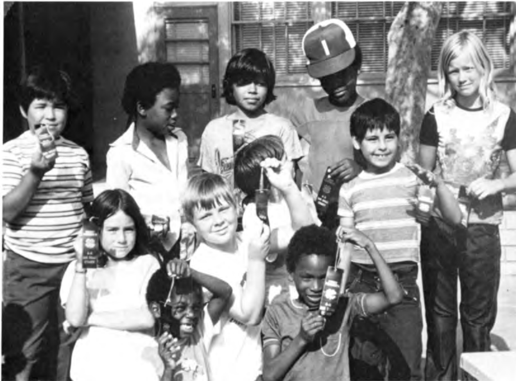
San Diego County 4-H'ers proudly display ribbons from their ice cream eating contest. Having fun is an important part of any 4-H project, and Community Pride is no exception.

In the urban area of Fresno, a group of youth campaign to make public transportation more widely available in their community.