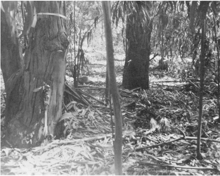
Interior of a blue gum eucalyptus stand, showing the predominant large trees surrounded by saplings. Because of high ground fuel loads and their chemical inhibitory effect, other understory vegetation is sparse or absent.

The eucalyptus stands were quite dense, reflecting initial spacing of the early twentieth century plantations, excellent survival of the planted trees, and abundant reproduction since that time. Most of the trees were less than 5 inches in diameter at breast height (dbh) though the bulk of the basal area was accounted for by the larger trees (graph 1). The stand pattern on all 100 m 2 plots was an inverse-J shape, characteristic of an uneven-aged stand. However, there were very few trees in the 5- to 15-inch dbh categories; apparently competition from the larger trees restricted diameter growth of the understory.