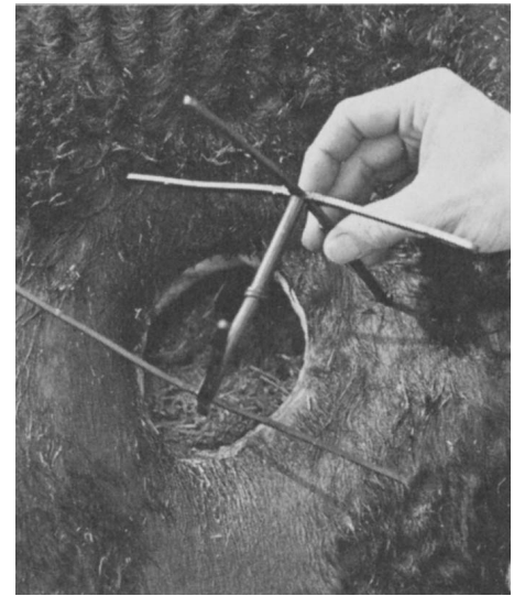
Approximate size of extended Rumen Reticulator is indicated above as it is hand-held above the 4-inch fistula into the cow's rumen.

after the low level had been reached (group B). There were no significant differences in milk fat production between groups, nor were there any effects of rumen stimulators on total milk production.