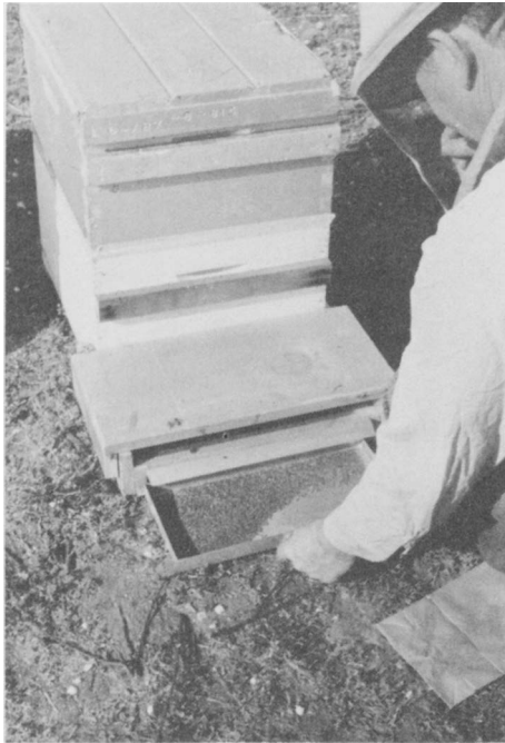
Pollen was collected in front entrance traps after all cracks in the hive body were sealed shut with masking tape, allowing entrance only through the pollen trap.

purposes. Group 2 collected about one-half the weight of pollen collected by group 3 during 1969 and 1970. Group 4 collected more than one and one-half times the pollen collected by group 3; and group 5 collected almost three times the weight of pollen collected by group 3. Table 3 lists the comparative relationships of pollen collection results for these five colony strength groups during 1969 and 1970. Results are expressed as a percentage of the pollen collected by colonies in strength group 3.