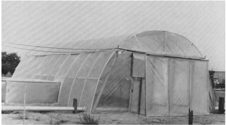
Field crop shelter used in 1968 tests as shown above had top and end sections covered with polyethylene, and lower side and exhaust tube cheesecloth-covered. Vestibule at end of shelter is also covered with plastic.

Temperatures inside the structures approximated outside temperatures except in the structure as covered in sketch detail A, on very hot afternoons with the fan off. The structures covered as in sketch B, permitted a fair approximation of outside temperatures, even without fans. A slightly cooler environment than the field was provided by the cheesecloth covered structure (sketch C). Radiant heat seemed more intense under the polyethylene than under the cheesecloth, and this was detected objectively by the soil temperature in containers used in 1968. Mean soil temperatures of containers illuminated through plastic were