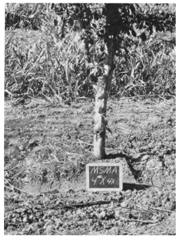
Johnsongrass control the season following repeated applications of 4 lbs/A MSMA. Note untreated area in background.

§ Citrange liners were about 12 months old at treatment.