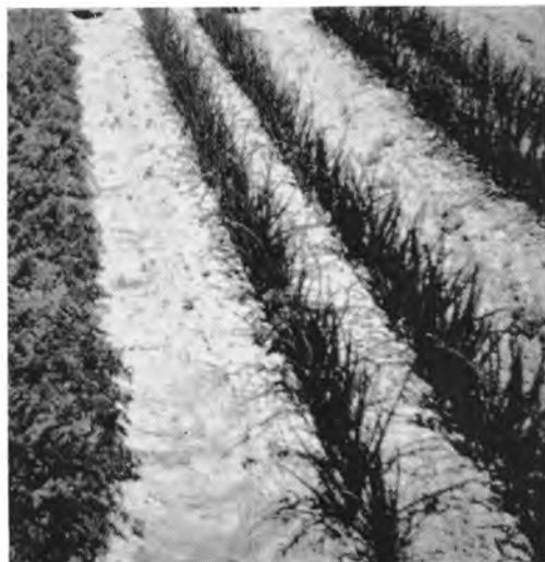
Photo above shows solid stands of onions under sprinkler irrigation in experiment four.