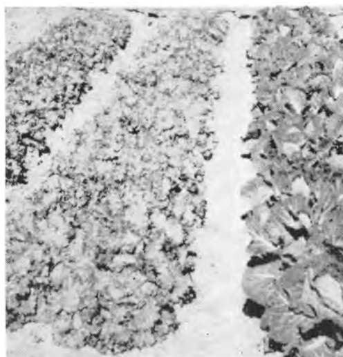
Photo above shows solid stands of lettuce and cabbage under sprinklers in experiment four.

Sprinkler irrigation reduced surface salt accumulation, increased water use efficiency, and cooled the soil surface more effectively than conventional furrow irrigation in recent tests. No detrimental effects were observed on lettuce, cabbage, carrots, onions or sugar beet seedlings from sprinkler application of Colorado River water. Emergence of seedlings was significantly higher with cabbage, sugar beets, carrots, and onions—and in some cases with lettuce—when sprinkled, as compared with furrow irrigation. When combined with precision planting, sprinkler irrigation resulted in earlier maturity of lettuce as well as highest yields obtained from a single harvest. Further studies will be needed to re-evaluate cultural practices involved in changing from furrow to sprinkler irrigation.