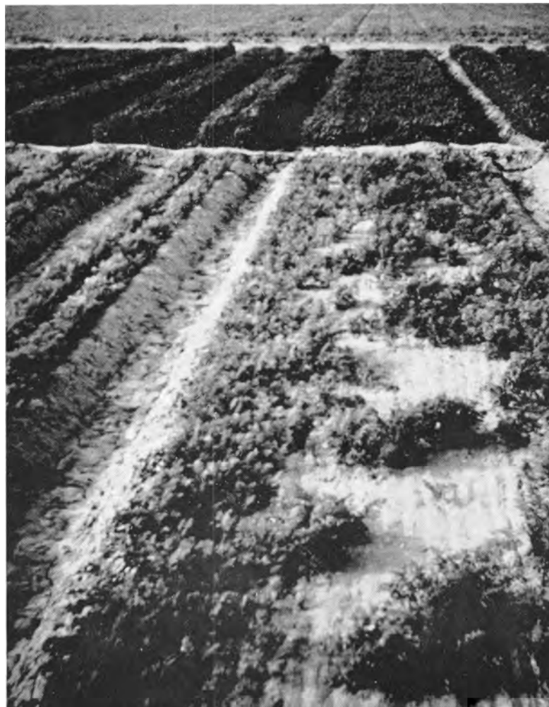
Photo below shows carrot beds with spotty stand in foreground resulting from furrow irrigation, in contrast to solid stand of larger plants in background that had been sprinkler irrigated.

The third experiment examined the microclimatic-modifying effects of sprinkler irrigation. This experiment was initiated on August 30, 1965 with pelleted sugar beet seed. Seeds were placed at 16 per foot of row by using an International Harvester 185 precision planter. Three irrigation regimes were compared, including (1) a continuous furrow flow of water until the seeds emerged; (2) furrow irrigation for one day per week; and (3) sprinkler application for one day, followed by three hours per day for the first week. The daily applications pre-