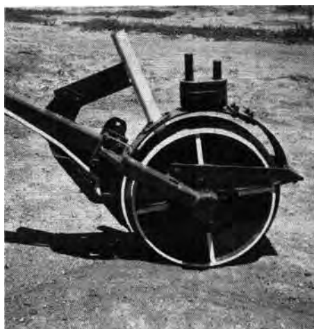
Closeup of the twenty-inch, double disk opener. Note the spray nozzle and depth rings. This unit weighs 188 lbs.

The fertilizer attachment on a standard grain drill delivers either granular or pelleted fertilizers, which allows single superphosphate to be applied to the soil surface in a band approximately six inches wide immediately ahead of each opener. Thus equipped, the rangeland drill can control weeds, fertilize, and plant