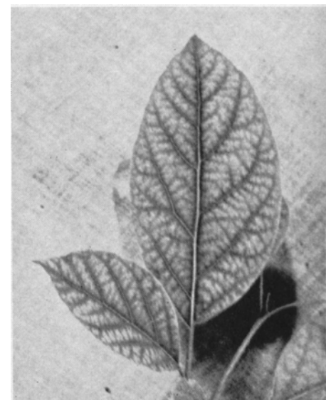
Iron-deficient avocado leaves.