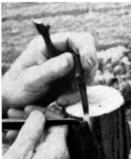
Inserting scion into stock just under strip of bark.