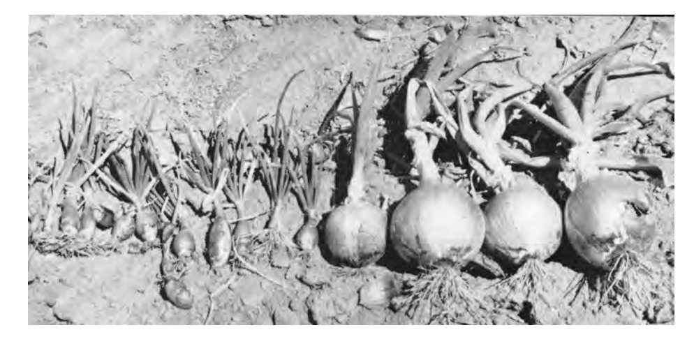
Stubby root nematode infestation was major factor in stunted growth of immature onions to left with leaves less than 5 inches in length, as compared with leaves over 10 inches long on onions from nematode-free soil seen to right in photo above.

In the fall of 1963, randomly scattered inarched trees with decline symptoms had trunk circumference measurements nearly identical to the trees with no decline. Randomly scattered trees showing decline symptoms in the fall of 1962 without inarching, averaged approximately 1.5 inches smaller in trunk circumference than either the normal or inarched declining trees (see table 2). It appears that the inarches not only saved the young trees, but sustained normal trunk growth.