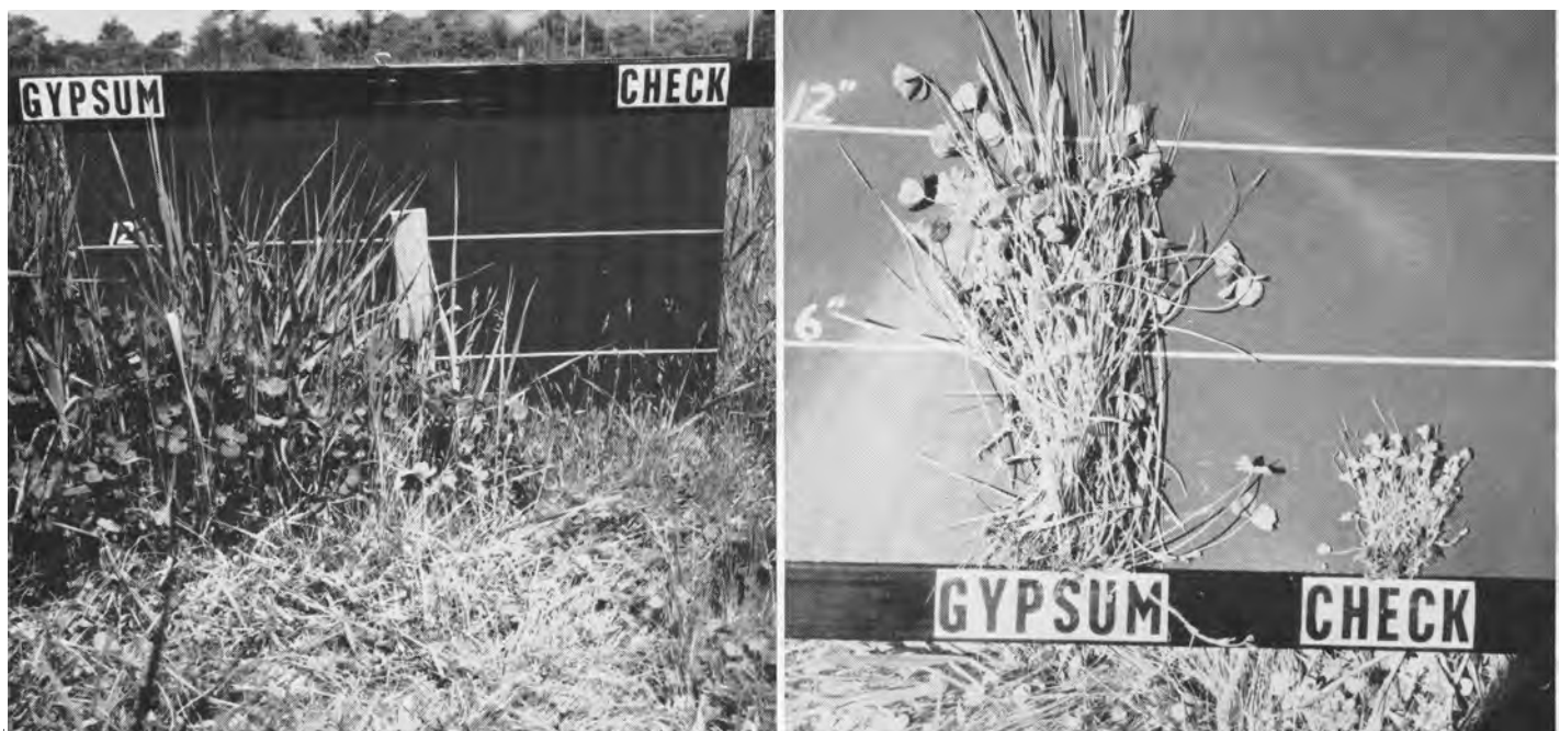
Hardinggrass, annual grass and subclover plants from trials fertilized with sulfur as gypsum at Burns Ranch, Mendocino Co., with untreated checks.

was the same in the three plant parts. In the high sulfur treatments more sulfate accumulated in the stems than in the leaves and petioles, but at the low levels of sulfur the sulfate sulfur concentration in the three parts was about the same. Rates of sulfur up to 20 pounds per acre increased yields and the organic sulfur concentration in the plants. The sulfate sulfur concentration in the plants changed very little up to this point. At rates in excess of 20 pounds per acre, however, yields were not increased. Organic sulfur increased very slowly, but the sulfate concentration increased rapidly.