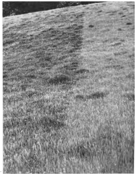
Stand of subclover and annual grasses fertilized with gypsum, left, as compared with check plot to right at Hopland Field Station.

S TUDIES ON the sulfur requirements of subclover, Trifolium subterranean L., were initiated because of the importance of this species in the coastal counties of California where sulfur deficiencies in the soils are widespread. It has been discovered, for example, that many yield