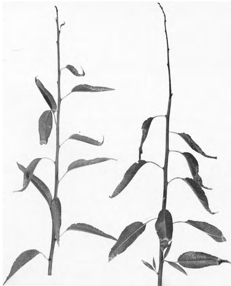
Boron-deficient almond shoots showing leaf scorch and dieback on current season's growth. This type of injury is found on watersprouts and other vigorous shoots in late spring or early summer.

The above progress report is based on Research Project No. 1097.