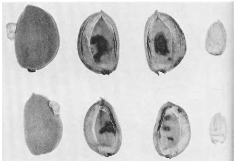
Boron-deficient almond nuts. With this amount of injury, they will usually drop in May or June.

obtained with a spray material (66 per cent B_2O_3 ) when applied annually at the rate of 1 to 2 pounds per 100 gallons of water. The time of spraying is probably not critical since good results were ob-