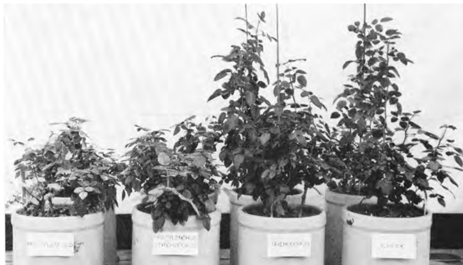
Roses grown in soil infested with root-lesion nematode—two crocks on left. Roses not infested with root-lesion nematode—two crocks on right.

Dave Almquist of the Armstrong Nursery cooperated in the studies reported here.