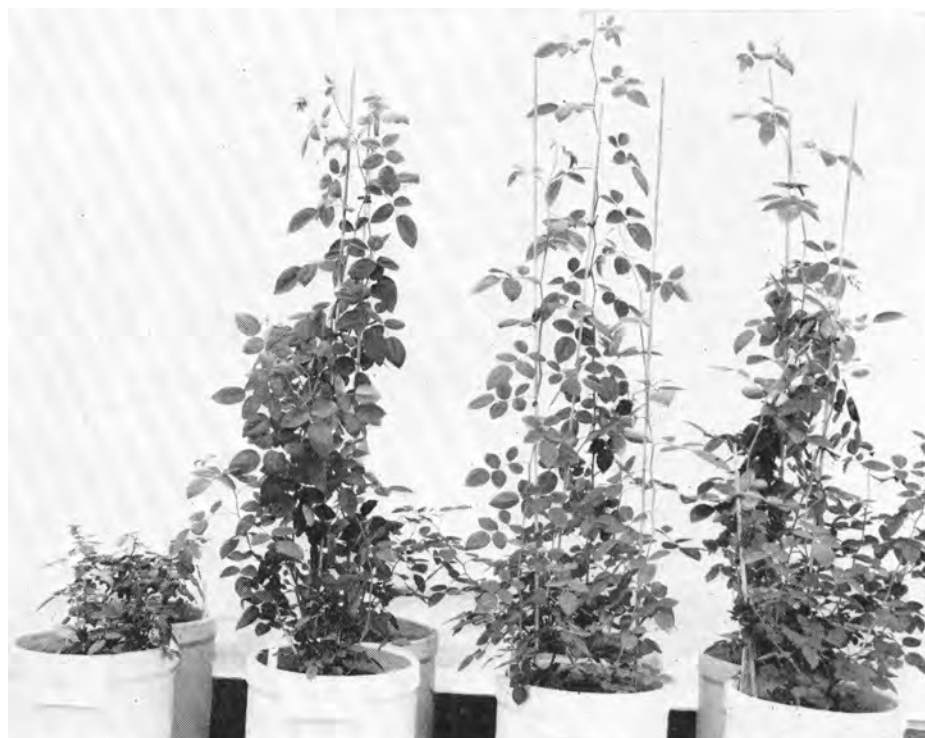
Rose plants grown in fumigated field soil—three crocks at right—and unfumigated soil—crock at left.