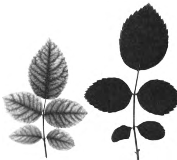
Leaf from plant grown in root-lesion nematode infested soil on left. Leaf from plant grown in noninfested soil at right.

Nine months after planting the rose plants—var. Dr. Huey—in all the treatments showed a visible response over the plants in the untreated plots. The average dry weight—in grams—of the tops of 10 plants from each treatment and from the