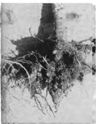
Infested with the clubroot organism. Cross generation. Right: susceptible clublike malformations.

when various lines of sprouts and related crops of the cabbage species — Brassica oleracea — were tested for resistance in heavily infested soil at Half Moon Bay. One of the lines of cabbage tested remained completely free of the disease throughout the season despite severe damage to adjacent plant-