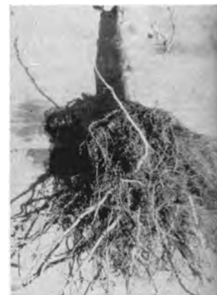
Roots of plants grown on soil infected with clubroot. Left: resistant plant of the breeding project; right: Brussels sprouts; note the thickened roots.

Work on the breeding of resistant Brussels sprouts was initiated in 1952,